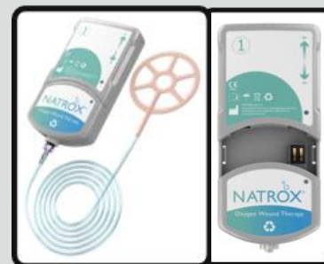
Figure 1: Natrox® oxygen wound therapy device connected to its oxygen distribution system (ODS)

Methods: This is a case study of 2 patients who received 3-months of Natrox® topical oxygen wound therapy. The Natrox® oxygen therapy system (Figure 1), developed by Inotec AMD Limited (Hertfordshire, UK), employs a small battery-powered 'oxygen generator' (OG) to concentrate atmospheric moist oxygen at a rate of around 13mL/hour through a fine, soft tube to a dressing-like 'oxygen distribution system' (ODS), which is placed over the wound and is held in place by a conventional dressing over the wound bed.