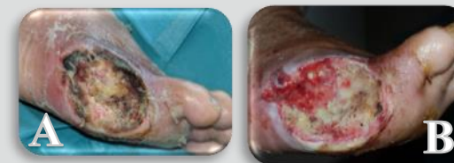
Figure 2. A) Wound bed prior to Natrox oxygen wound therapy. B) Wound bed after Natrox oxygen wound therapy.

Case 1: Subject A is a 50-year-old Chinese male with a history of poorly-controlled diabetes and on long term immunosuppression following a renal transplant for NSAIDs induced renal toxicity. He presented at a late stage with an infected ulcer over the right plantar fifth metatarsal. On examination, pedal pulses were weakly palpable, wound appeared dried slough overlying dull granulation with area of necrosis on wound edges, and foul smell emanating from the ulcer. At the time of admission, serum inflammatory marker were markedly elevated and arterial duplex assessment revealed moderate calcification with multiple stenoses in the right lower limb vasculature. Surgical wound debridement was performed to drain 2cm by 2cm abscess over the lateral aspect of 5 th metatarsophalangeal joint.