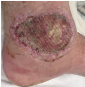
Figure 8. The wound following failed skin graft (January 2018)