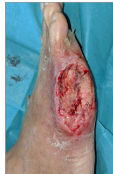
Figure 3. Month 1 of treatment (February 2018)

Due to the complex and non-healing nature of the wound, along with the associated comorbidities, NATROX was selected in order to increase oxygenation and thus stimulate healing. The goal of therapy was to reduce the wound size and improve the condition of the wound bed to facilitate a skin graft. Within 1 month of NATROX treatment there was an increase in granulation tissue and some decrease in wound size [Figure 3].