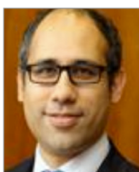
Authors: Tang Tjun Yip, Borripatara Wongprachum, Ibbi Younis

This article is based on a symposium entitled ‘NATROX Oxygen Wound Therapy – A Vital Element in Wound Healing’, which was hosted by Inotec AMD at the Malaysian Society of Wound Care Professionals conference in Kuala Lumpur on 22nd September 2018. The symposium highlighted the role of oxygen in wound healing and how, through an improved method of delivery (NATROX, Inotec AMD), topical oxygen can be a viable and practical treatment for non-healing wounds. Three clinical experts from around the world explored their use of NATROX in a variety of wound types and shared case studies and real-world knowledge in practice.