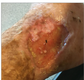
Figure 9. Some improvement when compression therapy commenced although once initial improvement remains static (June 2018)