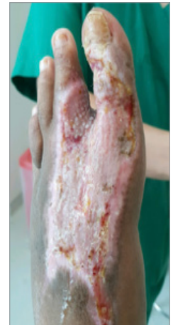
Figure 7. Month 3 of treatment (August 2018)

decreased in size and the patient was able to undergo a skin graft and progress to healing within 9 weeks of treatment [Figure 7].