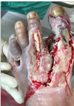
Figure 5. The wound on presentation (May 2018)

While the benefits were apparent, due to the complexity of the case, longer-term treatment with NATROX was required and resulted in significant improvements as treatment continued [Figure 4]. After 3 months of therapy the wound was at a stage where a skin graft was planned.