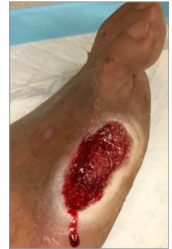
Figure 4. Month 3 of treatment (April 2018)

While the benefits were apparent, due to the complexity of the case, longer-term treatment with NATROX was required and resulted in significant improvements as treatment continued [Figure 4]. After 3 months of therapy the wound was at a stage where a skin graft was planned.