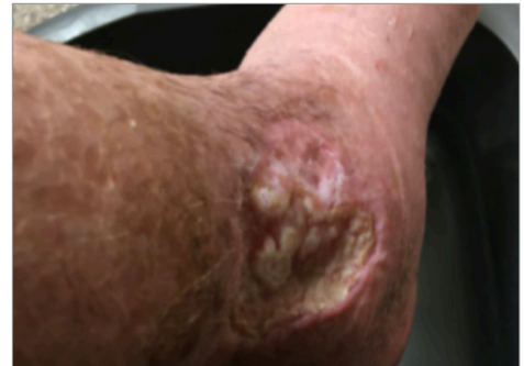
Figure 10. Continued non-healing upon commencing treatment with NATROX (August 2018)

Following 21 days of treatment with NATROX, significant improvement was seen, with the wound finally progressing towards healing [Figure 11]. This resulted in huge benefits to the patient's quality of life, meaning that she could resume everyday activities and go on holiday, and she was extremely pleased with the results.