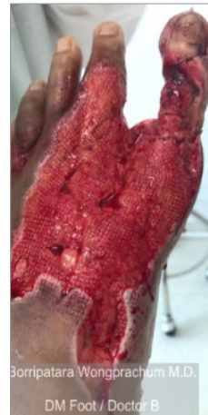
Figure 6. Month 1 of treatment (June 2018)

The patient responded very well to the treatment, which quickly resulted in increased granulation, with granulation tissue covering previously exposed bone [Figure 6]. The wound