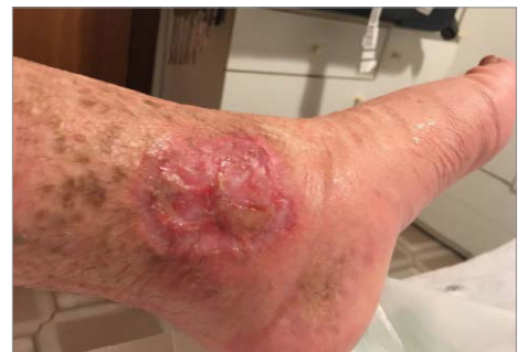
Figure 11. The wound following 21 days of treatment with NATROX (September 2018)