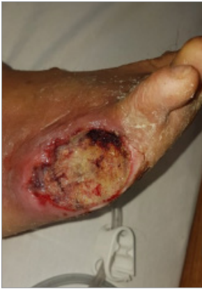
Figure 2. The wound following reperfusion and debridement (January 2018)

of wound aetiologies and clinical scenarios. The cases below were selected as examples to illustrate the breadth of potential uses and in differing goals of therapy.