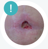
NON-HEALING SURGICAL WOUND

NATROX® O 2 can be used during any phase of wound healing, and works with any secondary wound dressing.