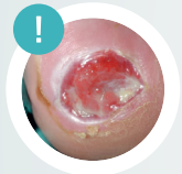
DIABETIC FOOT ULCER

It is intended for use on complex, slow healing or non-healing wounds such as: